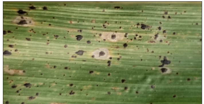
Figure 3. Tar spot stromata can be surrounded by a narrow tan halo.