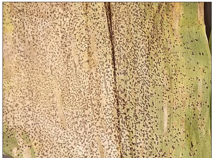
Figure 4. Leaves affected by tar spot can have densely packed fungal structures.