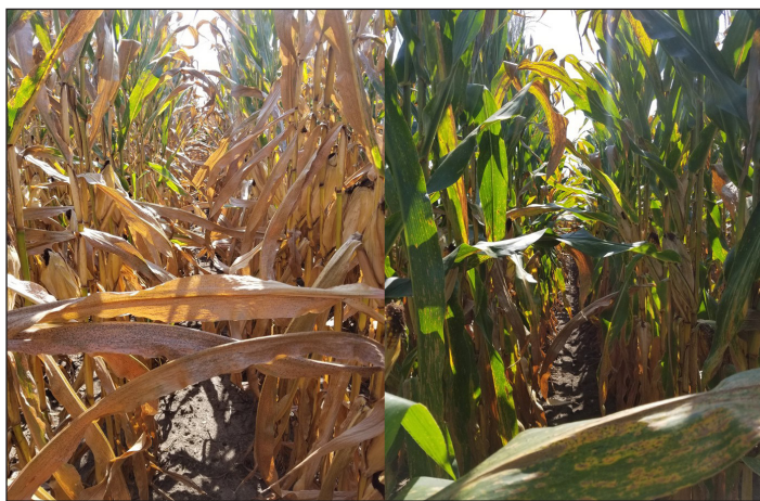
Figure 5. Both hybrids infected with tar spot were in adjacent plots. The hybrid on the left had increased tar spot severity (>40%) leading to rapid senescence, while the hybrid on the right had decreased severity (25%) and remained green longer.

Tar spot is considered the most important foliar disease in Latin America, particularly Mexico. In Mexico and Central America, P. maydis is not widely considered to cause economic damage when present alone, although there were isolated reports of damage in old literature. However, significant yield losses were reported from the tar spot complex, consisting of P. maydis and another fungus ( Monographella maydis ) associated with tar spot.