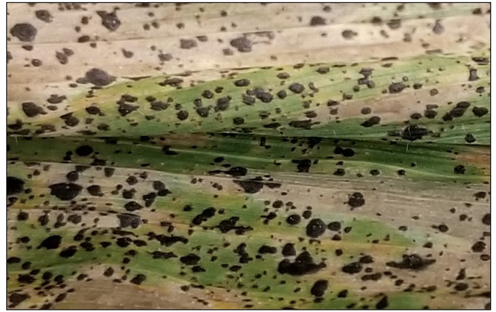
Figure 2. The tar spot fungus Phyllachora maydis produced raised, black fungal structures called stromata on leaves, stem, and husk of the affected corn plant.

The fungus that causes tar spot is an obligate pathogen and requires a living host to grow and reproduce. Researchers believe that the fungus is surviving over winter in Indiana on infected corn debris on the soil surface within stromata. Other fungi related to the tar spot fungus overwinter in a similar fashion by infecting grasses and weeds. It is unknown how long the fungus will survive in this debris outside